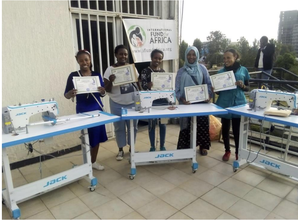
Graduates who qualified to receive sewing machines with IFA's program coordinator.