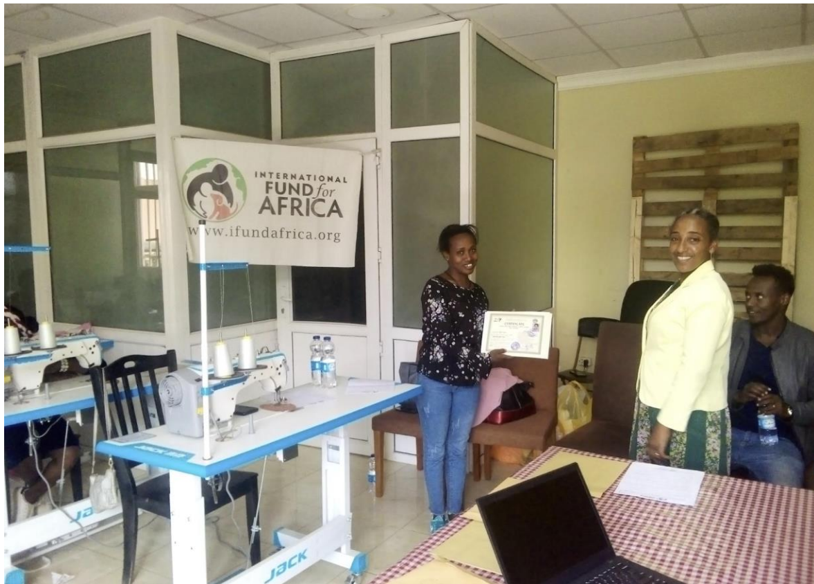
Completion Certificates awarded to graduates by the Addis Ababa Women, Youth and Children Social Affairs Officer.

Here are some the photos of the recent graduates and the program